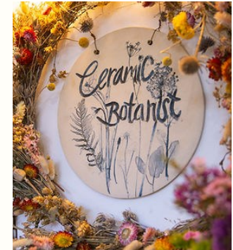
The Ceramic Botanist @ceramic_botanist www.louisecondondesigns.co.uk

For preserving petals in sterling silver jewellery.