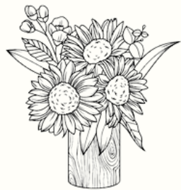
Don't Throw The Bouquet @dontthrowthebouquet www.creationswitha.co.uk

For pressing and framing your wedding flowers.