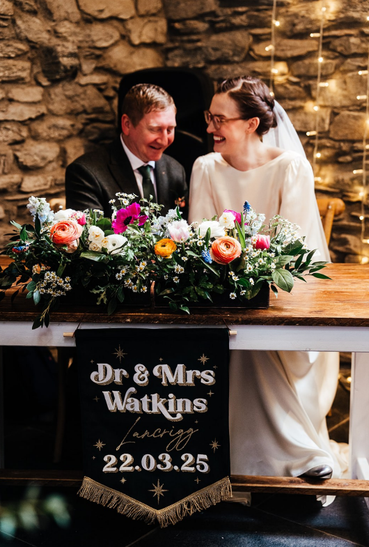
Cath Prescott Photography