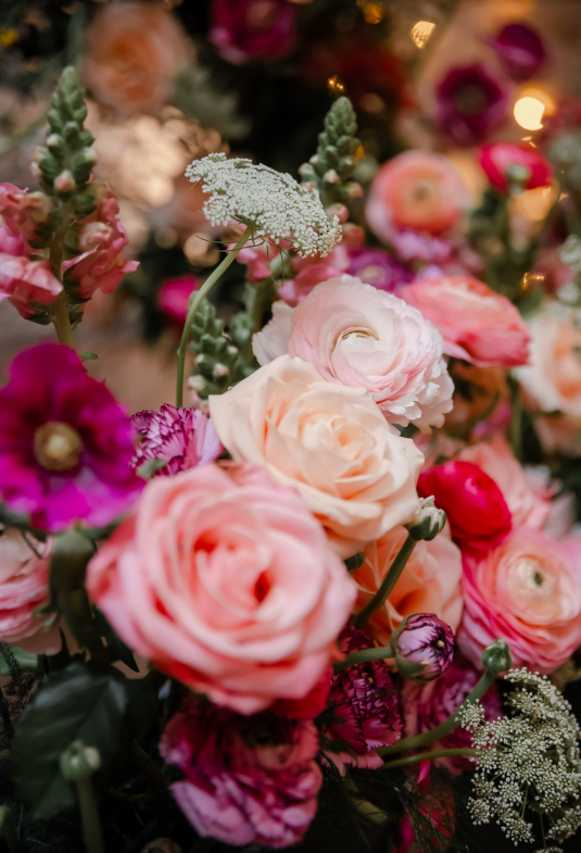
Wild and Dreaming