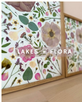
Lakes and Flora @lakesflora_ www.lakesflora.co.uk

Your wedding flowers hold precious memories, and preserving those blooms allows you to carry a piece of your special day with you forever. Here, you'll find a curated list of trusted flower preservation companies ready to turn your wedding blooms into heirlooms you'll cherish for a lifetime.